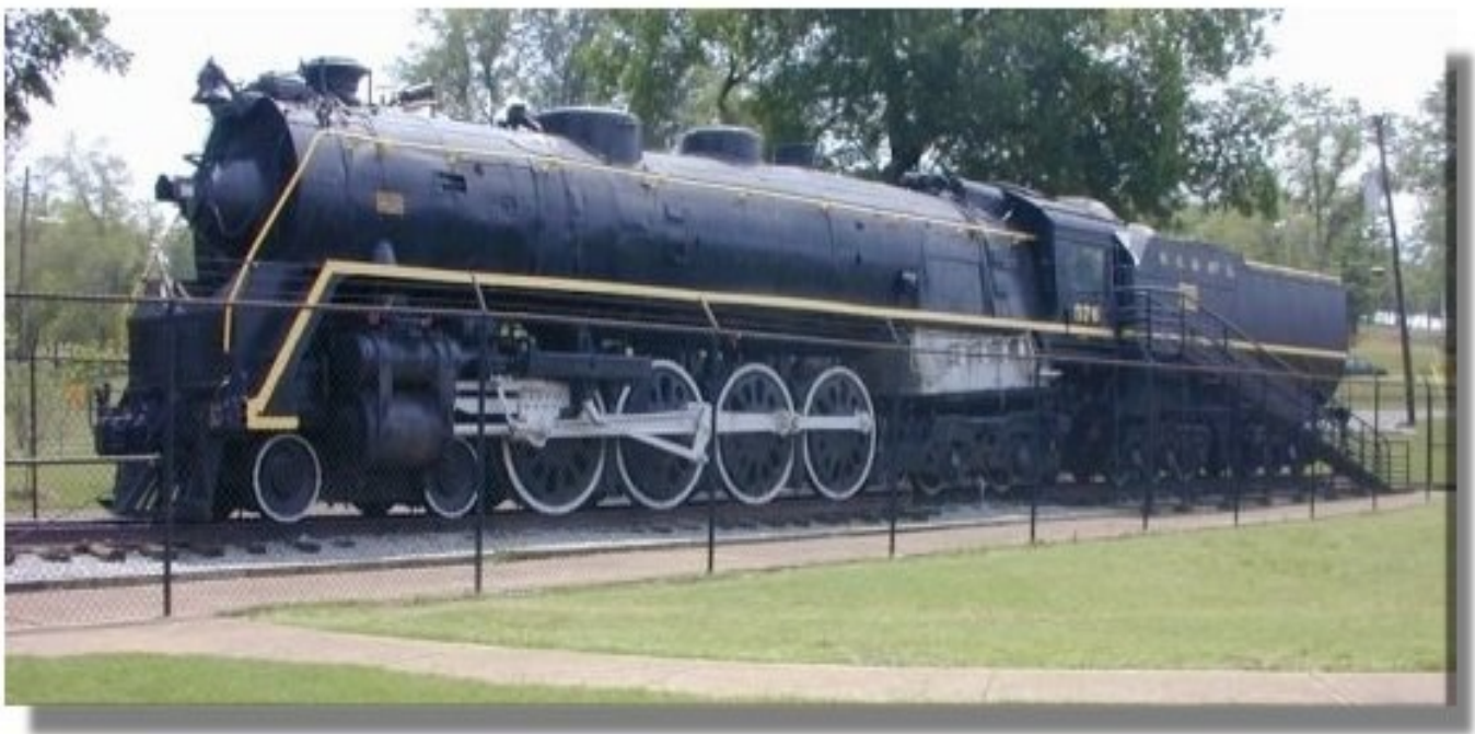
#576 today in Centennial Park, Nashville.

After the traffic surge died down from the Second World War, and traffic died down, the J3's were bumped from prime service spots to lesser passenger and freight trains. Eventually, by September 2 1952, all of the J3's were withdrawn from service. All of them except #576 were scrapped. The only surviving example of mainline NC&StL steam, J3-57 class locomotive #576 has been on static display in Centennial Park.