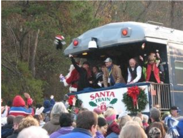
Wynonna Judd tosses a stuffed animal to a lucky child at Elkhorn City, KY

Indeed the contribution of CSX cannot be overstated. The former Clinchfield line sees an average of 22 trains per day, most of which transport coal. On the day in which the Santa Train operates, the entire line from Shelby to Kingsport basically shuts down. Only two trains were spotted during our nine hours aboard the Santa Train and both were waiting or tied down on sidings. With a contingent of CSX employees actively working on board as well as those handling trackside safety, there is a strong CSX involvement beyond the tracks and the office cars comprising the Santa Train. Though national news media has ridden the Santa Train on select years, the Santa Train remains a "community service first" operation which garners limited publicity outside the region it serves.