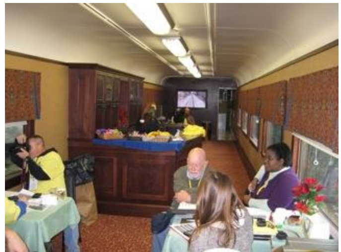
Note the large screen at the end of the car which projects live video from the train's rear platform

We re-boarded the busses at 5:30am on Saturday November 20, 2010 for the 8 mile drive to the CSX Shelby Yard where the 9 car Santa Train waited. A pair of CSX engines led the train with the trailing unit, CSX 9999 having started its career as Amtrak 288. The train's 9 cars (from the CSX office car fleet) were smartly painted in blue CSX livery. Members of the media were assigned to the sixth car, the Tennessee, a cafe/lounge/dining car built by Pullman in 1957 as a 52 seat coach. Only eight members of the media plus a CSX video crew had been invited to ride as the Santa Train is a working train not an excursion operation. Our day was neatly choreographed with opportunities to detrain at alternate stops to permit the collection storylines at various communities with on board interviews at established times between stops. CSX office car "Tennessee" was home base for invited media. This car serves as a cafe/lounge/dining car.