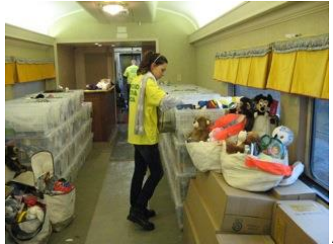
volunteer fills burlap bags with toys and stuffed animals for the next stop.

Several of the office cars behind the Tennessee were loaded with 15 tons of toys to be distributed at the day's 14 stops. Many of these had been packed in color coded bags to be handed to children of the appropriate age; lime green bags were intended for babies, red bags for girls up to age 9, purple for 9-15 year old girls, orange bags for boys up to age 9, etc. Other volunteers would tote heavy burlap bags jammed with stuffed animals, playing cards, toy cars, coloring books, and other popular items which would be given individually to kids of the appropriate ages. And a third group of volunteers would roam the crowd distributing rolls of wrapping paper to eager adults. Amazingly all of these items neatly lined the walls of the forward office cars in containers that made the distribution process orderly. A similar setup maintained supplies of candy and soft toys waiting to be tossed from the rear platform. It was clear that the Kingsport Chamber had the process down to a science as it was imperative that the train arrive in Kingsport on time since Santa was to ride aboard a fire truck in the annual Christmas parade. To maintain the schedule, each stop was scheduled for 15-20 minutes which meant toys, wrapping paper, and gift bags would have to be handed out efficiently.