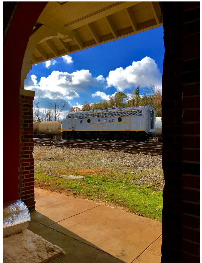
AN antique F-unit dressed in Clinchfield Heritage colors recreates a memorable image of what used to be

After retreating to our car, we partake of our boxed lunches while enjoying a twisting 40 minute ride along the Clinch River as it navigates between numerous mountains. Soon it is time to get to work as the train stops at Dungannon. This is our opportunity to hand out some gifts and John takes an armload of the colored bags while I take a burlap bag stuffed with individual toys for a variety of ages. The job of matching specific items (stuffed animals, matchbox cars, preschool CDs, playing cards, coloring books, etc.) to the appropriate aged children is challenging for a newcomer but the smiles and appreciation from the kids gives back an unforgettable warm feeling. Our respect for the volunteers who do this at every stop is enhanced as a lot more goes into this process than meets the observer's eye.