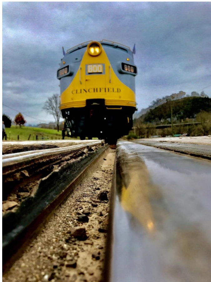
The photo-op offered an opportunity to safely approach No. 800 from a variety of angles