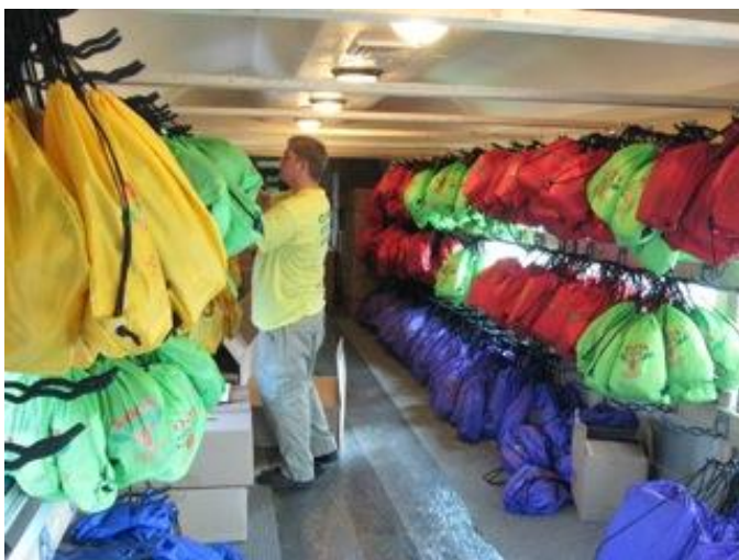
Color coded bags handed to children at the Santa Train's stops are color coded by children's age and gender.