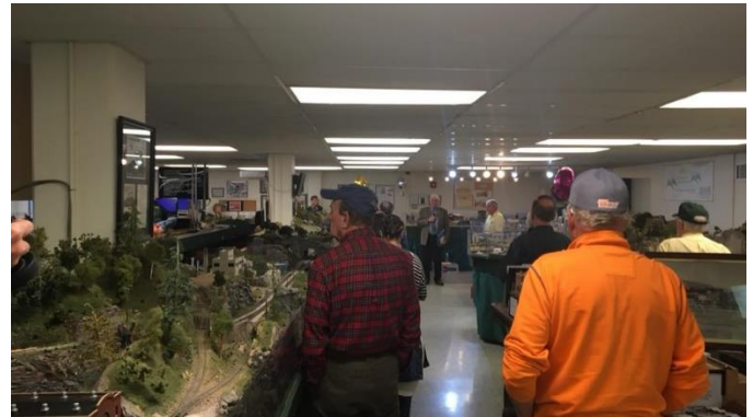
Some of the 100+ guests in attendance at the anniversary celebration