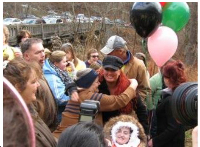
Wynonna Judd hugs an Appalachian woman in Fremont, VA.