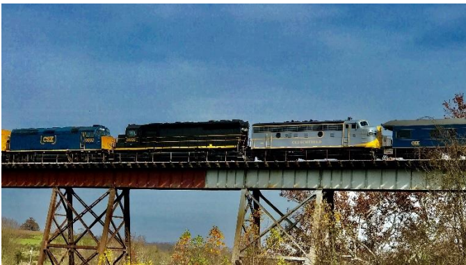
The 2017 Clinchfield/CSX Santa Train arrives in the Tri-Cities area on Thursday. Two locomotives were painted in Heritage colors for the event, seen in the photo above crossing the Boones Creek Trestle,