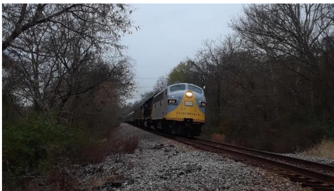
The Santa Train drifts southbound on Saturday

Indeed the contribution of CSX cannot be overstated. The former Clinchfield line sees an average of 22 trains per day, most of which transport coal. On the day in which the Santa Train operates, the entire line from Shelby to Kingsport basically shuts down. Only two trains were spotted during our nine hours aboard the Santa Train and both were waiting or tied down on sidings. With a contingent of CSX employees actively working on board as well as those handling trackside safety, there is a strong CSX involvement beyond the tracks and the office cars comprising the Santa Train. Though national news media has ridden the Santa Train on select years, the Santa Train remains a "community service first" operation which garners limited publicity outside the region it serves.