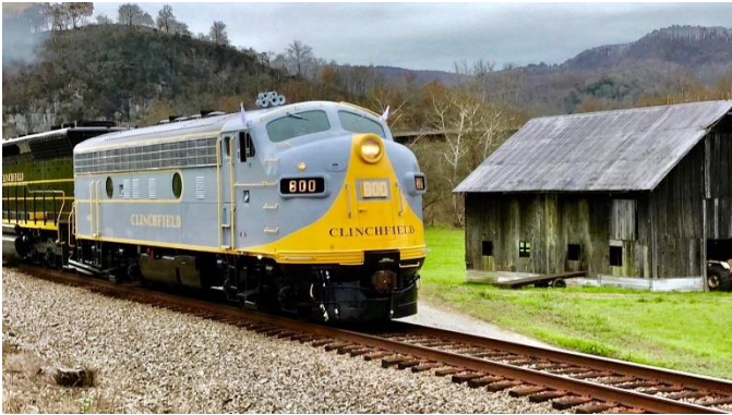
The Santa Train passed by several historic farmsteads on its holiday run