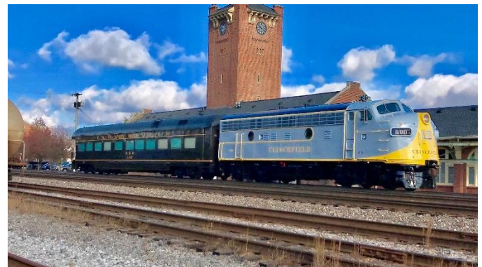
Railfan were offered a photo-op on Friday Morning with CRR 800 and business car 100 posed near the Kingsport Citizens Bank (ex-CRR depot).

from which he and a handful of volunteers toss candy and soft toys to the crowd of children encircling the back end of the train. Meanwhile, several other volunteers detrain and walk among the crowd distributing gifts, wrapping paper, and other goodies.