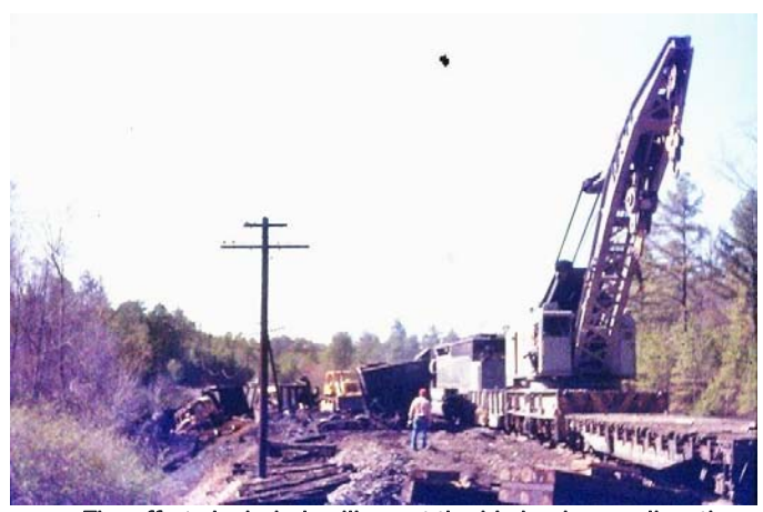
The efforts included calling out the big hook as well as the smaller MOW tractors... the second track to the left in the photo appears to require a total reconstruction of the right-ofway.

The previous photo and the next three show the cleanup efforts by the Clinchfield following the wreck at Bostic. 3619 looks worse for the damage to the cab and front wheelset.