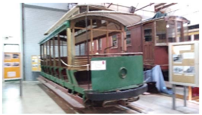
Several of the older more fragile cars in the collection are housed in the display shed... for example the partially restored wooden open trolley.