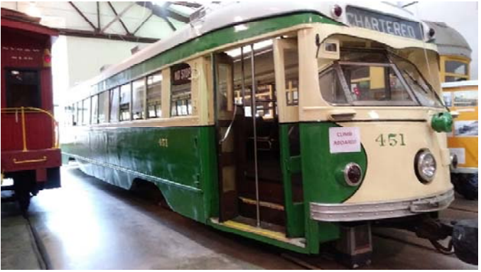
Looks like a bus, but is an excellent example of a PCC car.