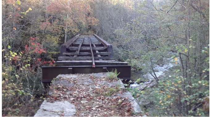
As you can see, the fall colors were at their bestlor our journey on the rail. Towards the slowdown, we came upon the bridge. A part of railroad history,

that will one day, be fully operating (if funding can be located). Recently, a couple were married up here, which gives you hope that more great things are possible for this lonely railway