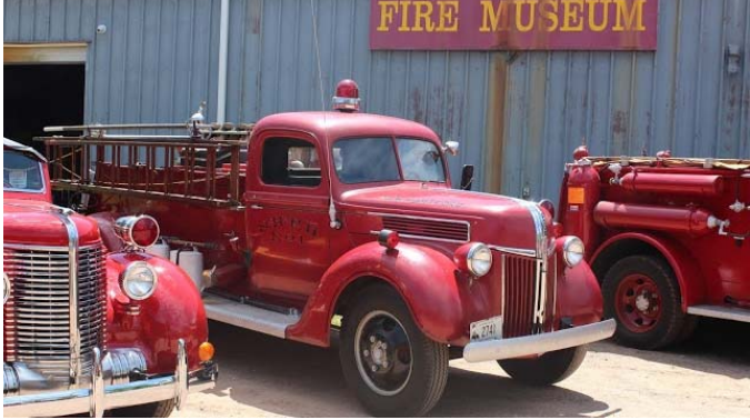
The newest addition to the museum if a building wxhibiting the Connectikcut Firefirghters Museum