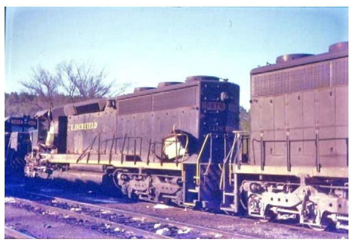
3619 is being towed back by a sister SD. It will be several months before 3619 receives a new cab and rebuild and is returned to service.