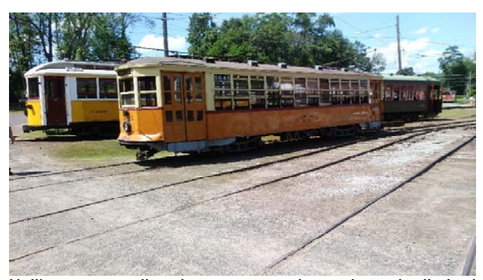
Unlike some railroad museums where there is limited protection from the elements leaving the restored cars to intemingle with rusted hulks, this muesum has nicely separated the prize pieces from the yet-to-be restored and equipment destined to provide parts for other restorations.