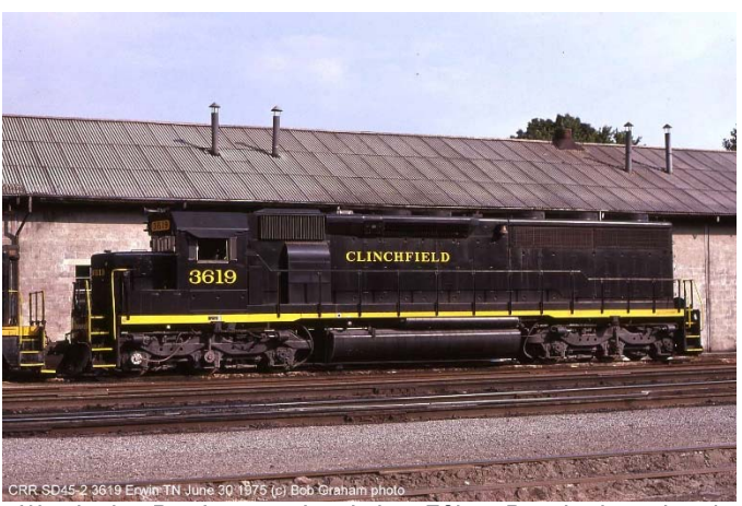
Wrecked at Bostic, sometime in late 70's ... Repaired repainted Family Lines. To SBD/CSX 8977... Retired 1989 to MRL 303. Scrapped by Schnitzer Steel in 2011

EDITOR"S NOTE: An interesting series of posts appeared on the Clinchfield Railroad Group on Facebook.com. It focused on the CRR No. 3619, the lead engine sideswiped in the wreck at Bostic on the CRR mainline. The postings contained a series off photos of 3619 throughout its history as well as photos from the wreck. What follows is the Facebook posts. Photos and text are used with premission.