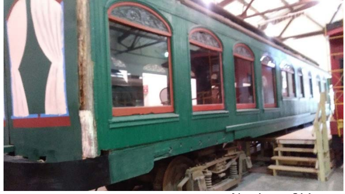
Under going restoration is a unique Northern Ohio Traction and Light parlor car 1500 .