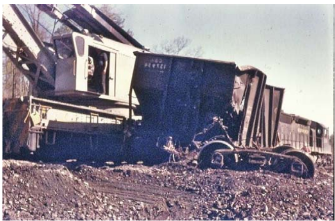
Rolling stock took heavy damage as evidenced by the bent and twisted hopper cars pushed aside and shorn of their trucks.