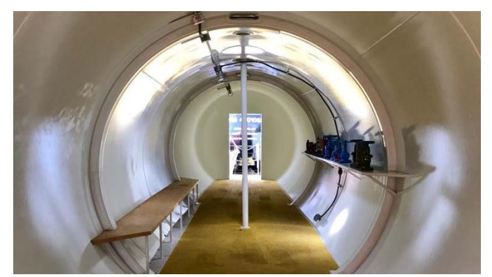
Even the tank cars are fitted out as instructional spaces with seating andd dispalys build into the curved walls.