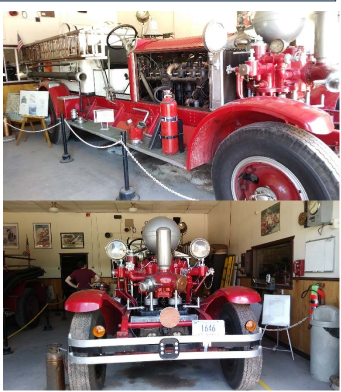
It holds arounf a dozen rare fure trucks albeit in cramped quarters. In the collection is an Areins pumper and a Ford ladder trunk with a tilerman position above the 85 foot extension ladder.