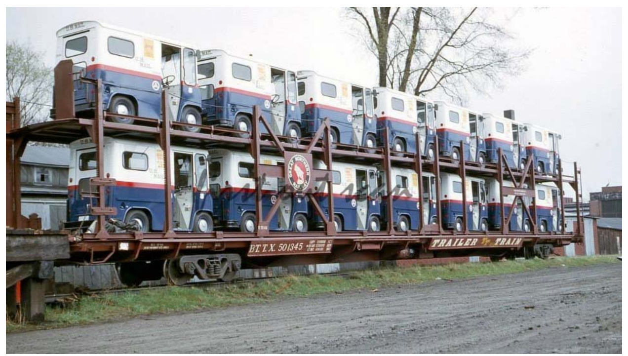
A bilevel autorack with a load of panel delivery truck for the Unites States Postal Service