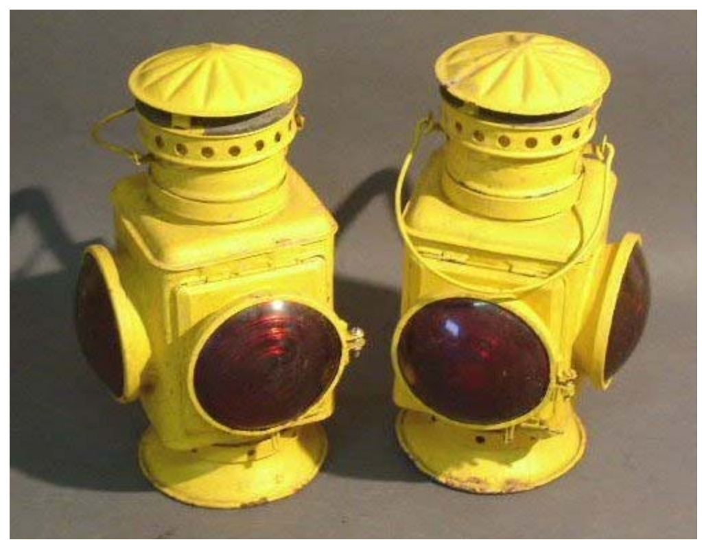
DON'T LET RED MARKERS HALT YOUR MEMBERSHIP RENEW YOUR MEMBERSHIP TODAY