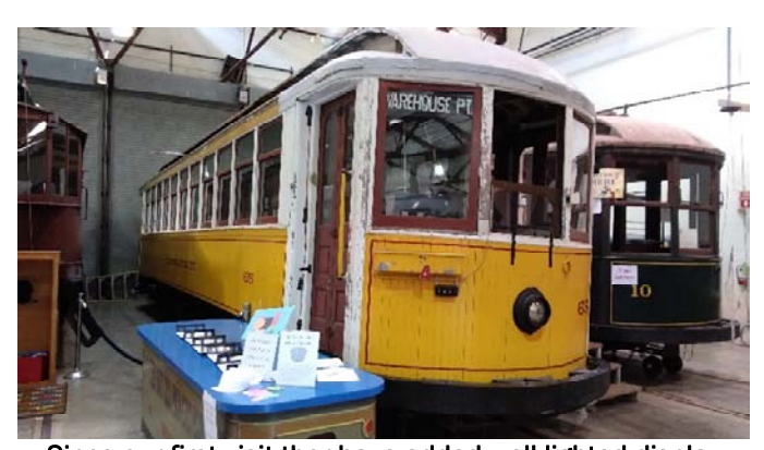
Since our first visit ther have added well lighted display building to their nicely appointed Office/Store/Visitors' Center. The building houses nearly a dozen street cars in varying states of restoration as well as displays, and a children's activity area. All the cars a accessible for close inspection. The building is clean and neat makuing for a comfortable place to view a significan portion of the collection and a relief from inclement weather should the day be too hot or rainy.