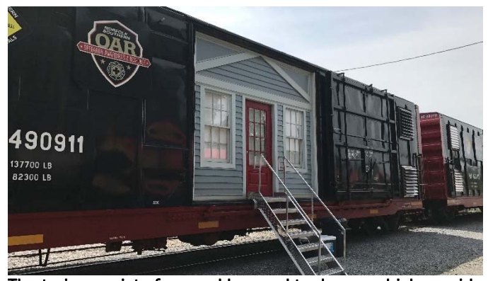
The train consist of several box and tank cars which provide classrooms, hands-on examples of equipment such as shut-off and discharge valves.