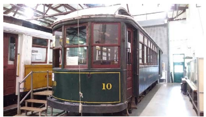
Safety appears to be an important part of the museum's operation philosophy... there are safety railings of stair's allowing entry to several available for viewing.