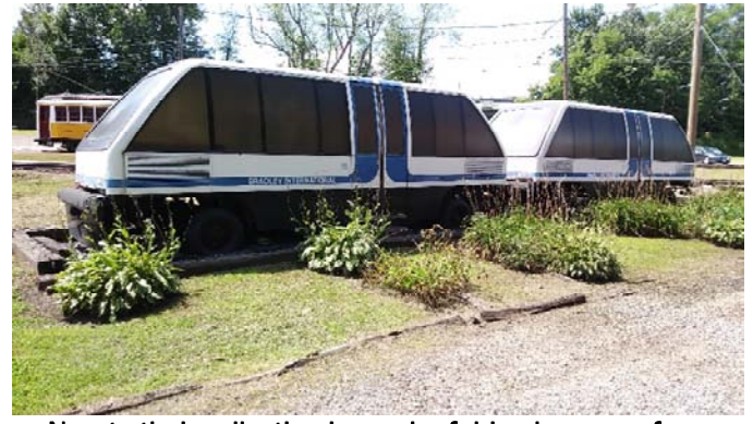
New to their collection is a pair of driverless cays from Bradley Internatoinal Airport, Boston MA on display. They represent an evolution in people moving and are comparable to Jacksonville FL's Skytrain, and Vancouver's airport shuttle.