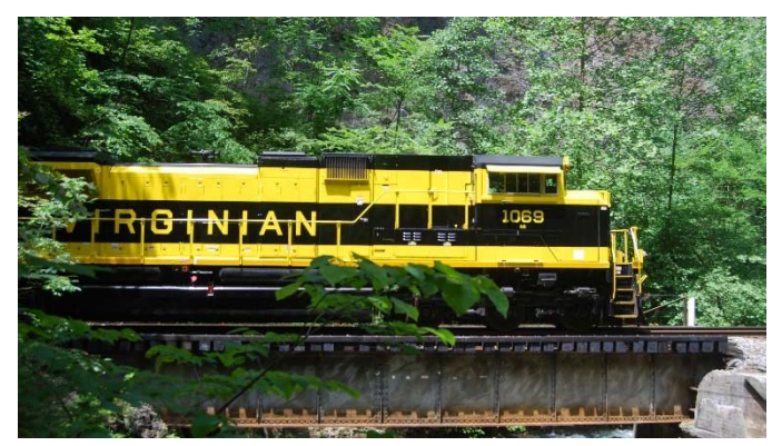
Norfolk Southern's Heritage Paint Unit for the Virginian RR at Natural Tunnel

THE N&W, VIRGINIAN AND THEIR SUCCESSORS TAKE CENTER STAGE FOR SATURDAY EVENT