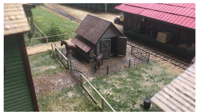
It's the little details that matter... the stable between the Cranberry General Store and Station could have been easily overlooked

seriously and dispatch them with skill and effectiveness. If you would like to put your hat in the ring to be an officer in the MEMRR or the Carter Chapter NRHS let the members of our current ad hoc nominating committees know of your interest. All positions are open for election each year and we are often seeking new officers to take up the role for those who have held these positions and now wish to step down and give another the opportunity to serve. The roles of our officers are critical to the success of our organizations and I encourage you to accept a nomination when it is offered and to express your appreciation to each of our officers, elected and appointed, for the work they have done for our clubs, the museum and for our members over the past year.