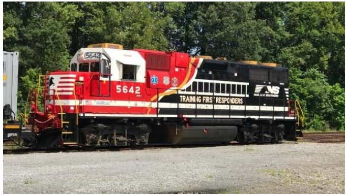
The train is powered by NS 5642, the special paint unit "Training First Responders." The locomotive is an EMD GP 38-2 painted in a scheme similar to NS 9-1-1.

EDITOR'S NOTE: In September of 2017 Paul Haynes and Gary Emmert had the opportunity to tour the First Responders Training Lab. The Lab is a special train provided by Norfolk Southern and travels the system to train fire, police, and emergency medical personnel on handling the complexities of derailments and leaking tank cars.