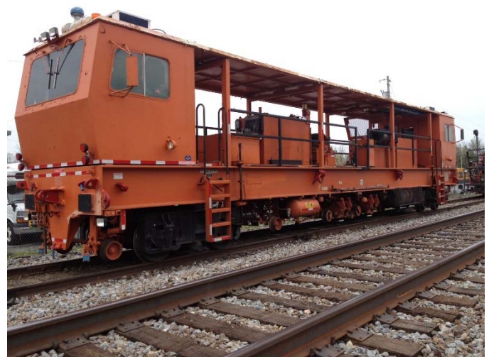
SPIKE DRIVERS - Spike driving machines can drive up to two spikes per rail at once for a total of four at a time in each tie. These Maintenance-of-Way (MOW) spike machines are hydraulically operated.