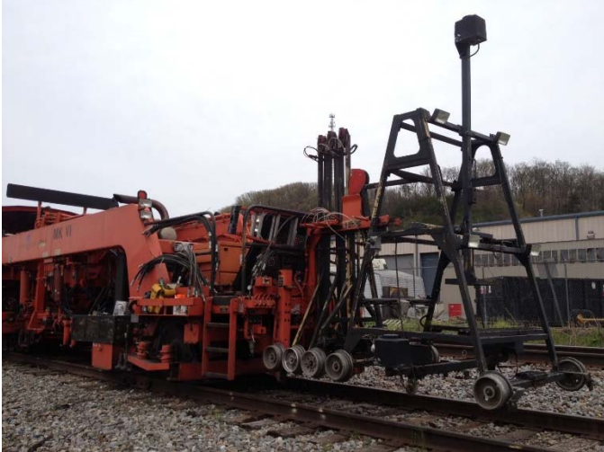
TIE CRANES - Utilized in new Maintenance-of-Way (MOW) tie gang production and for the removal of old ties. These Maintenance-of-Way (MOW) units place and position rail ties in preparation for insertion in front of the rail tie inserter.