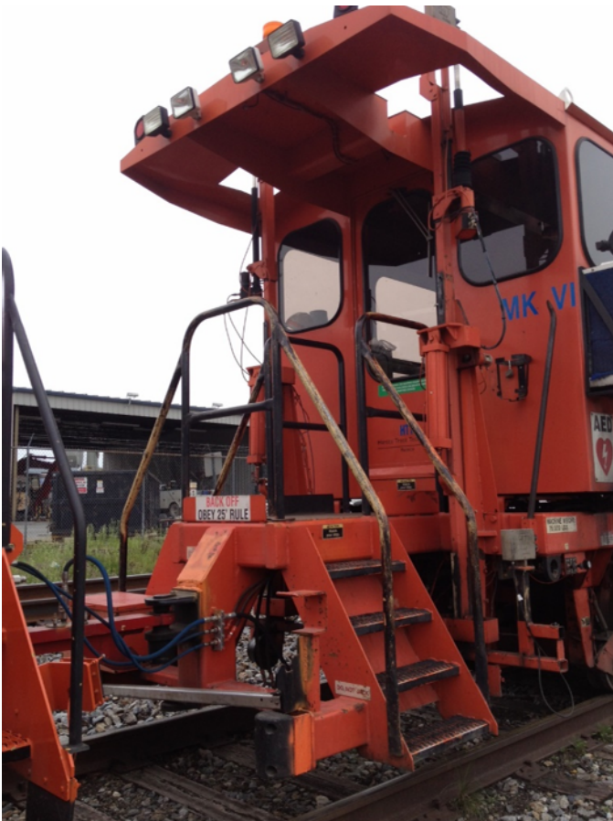
INSERTER REMOVERS/EXCHANGER - Rail tie inserter removers exchange up to nine ties per minute while maintaining track alignment. A railway Maintenance-of-Way (MOW) tie handler manages switch ties with ease while retaining proportional control for precise tie handling.