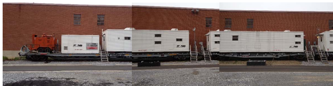
Bunk cars on siding in Johnson City yard - 2013. Photo

This past spring Norfolk Southern sent one of its crack track crews through the Tri-Cities area with mission of replacing its welded rail on the mainline. The crew spent nearly a week pulling spikes, replacing ties, removing the existing rail and replacing it with new welded rail. All grade crossings were also replaced or reconditioned. Approximately 7 miles of new rail were laid between Piney Flats and Telford. Paul Haynes caught the crew putting the Maintenance of Way (MOW) equipment up for the night in the Johnson City yard. Your Signal Bridge editor caught the team in action while working in Jonesborough. In this issue we will take a look at track maintenance and the equipment used by the railroads. All photos are by Paul Haynes and Ted Bleck-Doran unless otherwise noted.