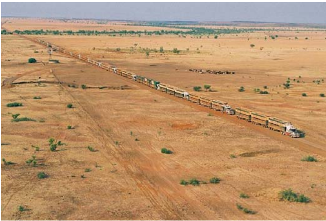
This is a recent email sent regarding the cattle trains at Helen Springs Station.