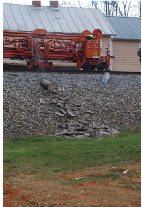
TAMPERS - Maintenance-of-Way (MOW) machines capable of raising, aligning and tamping, and resetting tie and rail assemblies, tampers are one of the most widely used MOW machines.