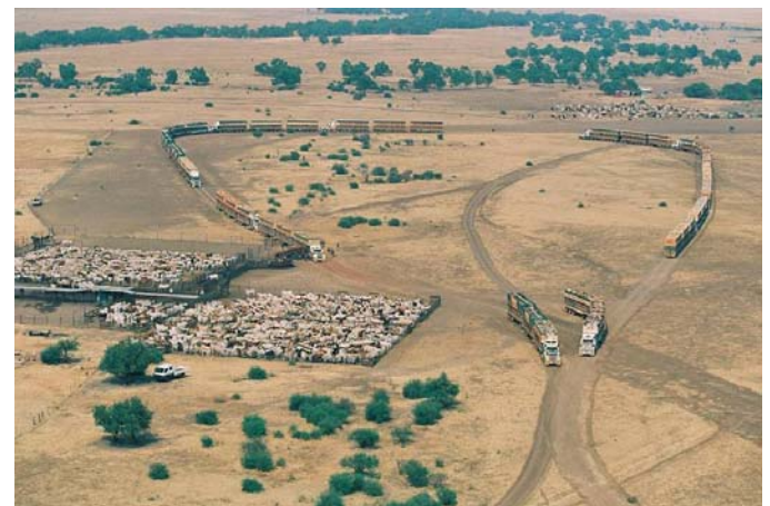
Road trains loading cattle at Helen Springs Station, north of Tennant Creek NT ..

Each trailer has 24 tyres plus a dolly with 8 tyres the 72 trucks there are 4,464 tyres on the road