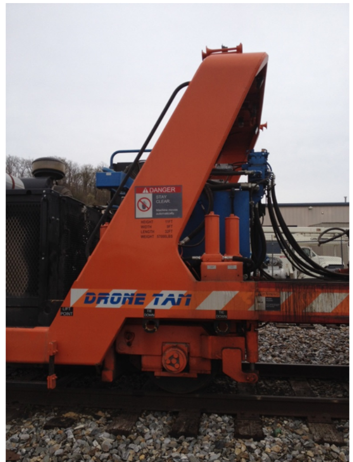
GANG SPIKERS - Automated railroad Maintenance-of-Way (MOW) equipment, rapid and safe spike-driving machines take the work out and put speed and safety in the unpleasant and time-consuming job of driving spikes in railroad track. Modern equipment makes one or two person operation practical.