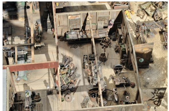
Anyone want to give it a try in 2012