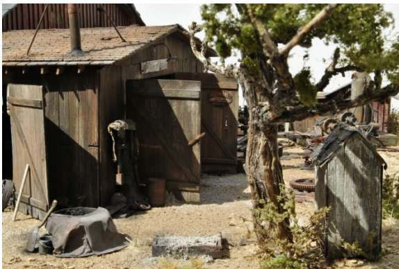
The weathering is superb