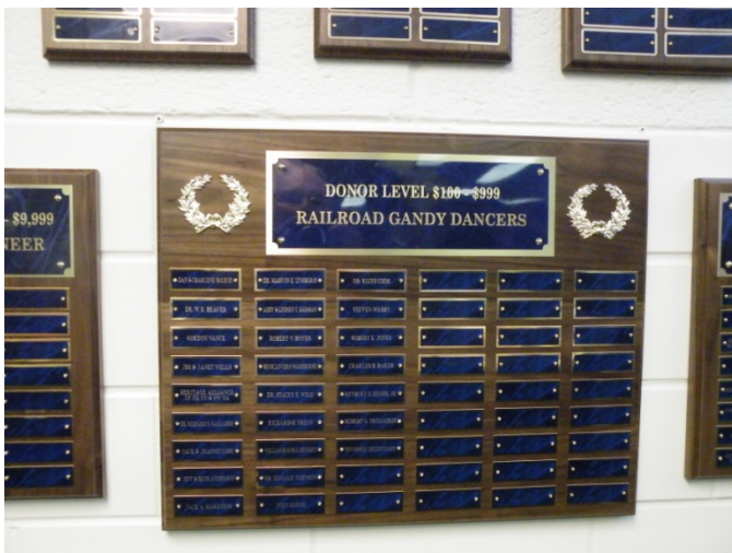
The George L. Carter Museum Donor Wall