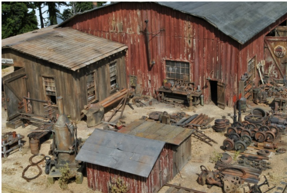
There is even a tarp draped off a bench