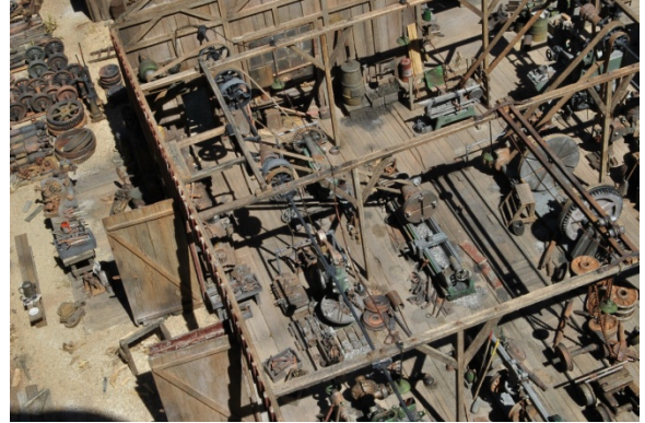
Lathes, Boring Mills, Presses all belt driven