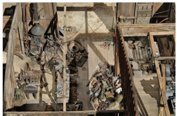
How about a diorama contest this May?