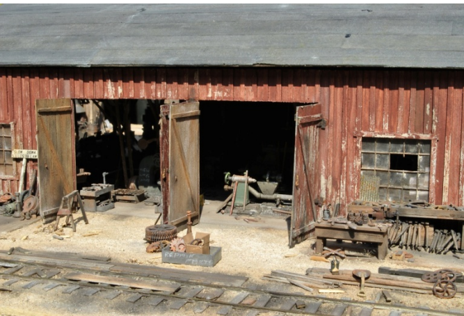
Remember this is HO Scale Modeling

the scene. I started to rebuild the main building with the machine shop in mind. I began to rebuild the main building with the machine shop in mind. I began to rebuild the main building with the machine shop in mind. I began to rebuild the main building with the machine shop in mind.