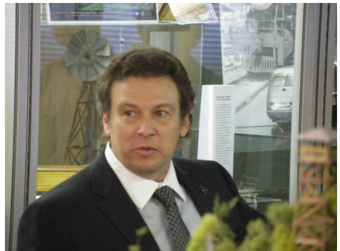
ETSU Videographer Presents a Video History of George L. Carter and the Museum's Development

There are opportunities at all levels for every member. Come on down to the museum and get to know your fellow club members who are actively engaged in these projects and get involved in 2013. You will enjoy working with these fine folks and we, in turn, will delight in getting to know your better and profit from the model railroading and life-experience talents you can bring to the organization.