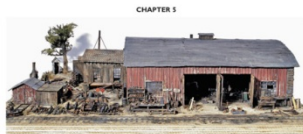
A 1930s MACHINE SHOP

BY ANDERS MALMBERG BY VOICE