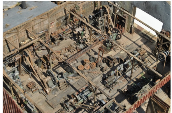
I expect there is club talent enough to create something like this