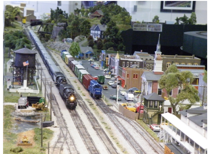
The ETSU Express on the MEMRR Layout