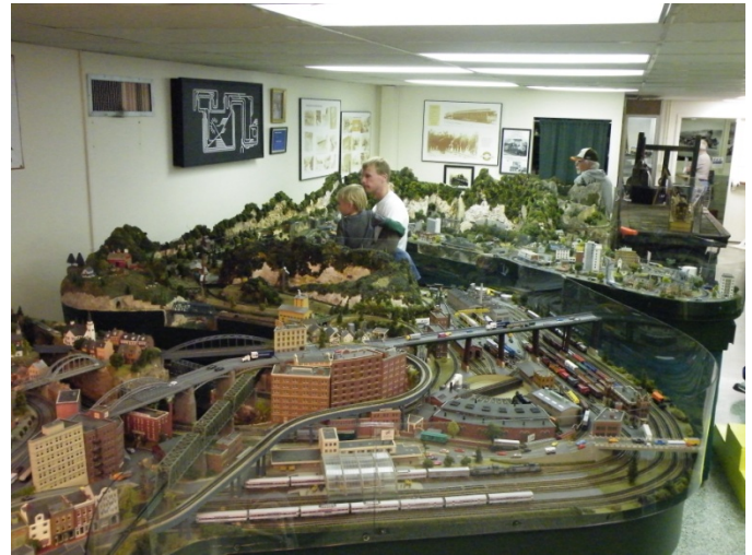
The Bankus N-Scale Layout

section, that are open for sponsorship. The minimum donation required is $1,000.