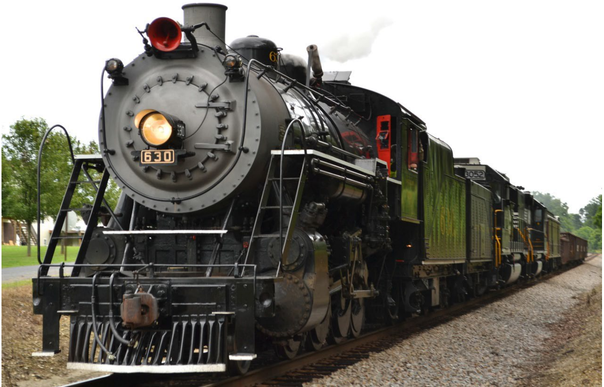
630 At Susong Road in Jonesborough