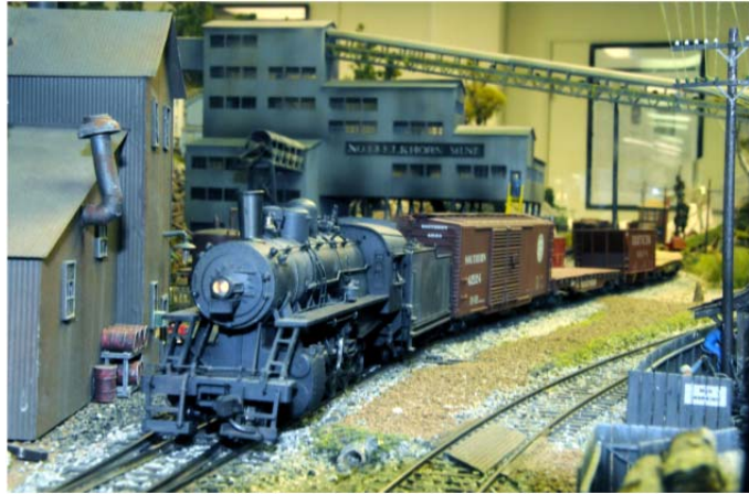
A steam train winds its way past a coal mine on the Mountain Empire Model Railroaders' large 22x44 foot railroad in the Campus Center Building at ETSU's George L. Carter Railroad Museum.

defunct, but well-remembered, East Tennessee & Western North Carolina Railroad, the 'Tweetsie' narrow gauge, which is now under construction. In addition to the displays, there is also a growing research library, a new National Railway Historical Society chapter, membership docent opportunities, and an oral history archive being established as part of the museum's programs. Info can be found online at