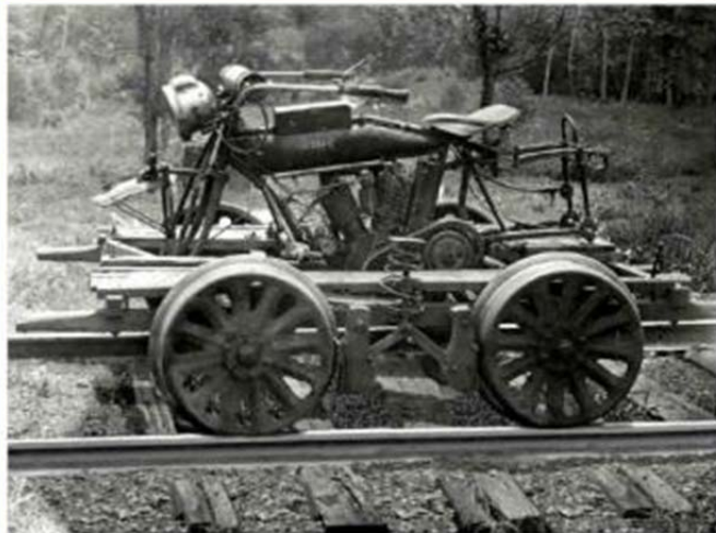
Hi-Railin' In Style Submitted by Gary Emmert

the books are now ready for members to check out. Some of the rarer volumes will have to be read in the library, but many books, magazines, and DVD/videos are now available for circulation. See Gary for details. Check out the Library at your earliest convenience. Besides its holding it is computer equipped and Duane Swank has finished out all the bookshelf facing with oak—very nice indeed!