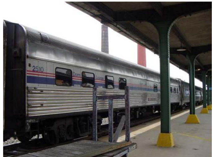
#2510 Pacific Patrol Birmingham, AL on the Northbound Crescent. ex Amtrak 2924(HEP) ex Amtrak 2624 Ex UP 1431 April 7, 2001 Matt Nelson