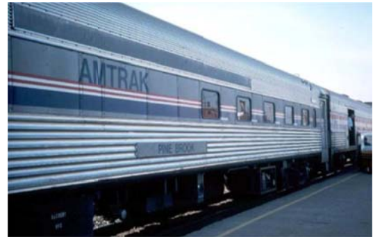
#2500 Pine Brook South Bend IN Oct 30, 1999 Dick Leonhardt

"All Eastern Single Level Long Distance trains operated with a Heritage Crew/Dorm - except the Cardinal (even though there were enough of these cars around to equip the Cardinal). It's not an issue of car shortage that is putting these Crew Cars in storage or out of service.