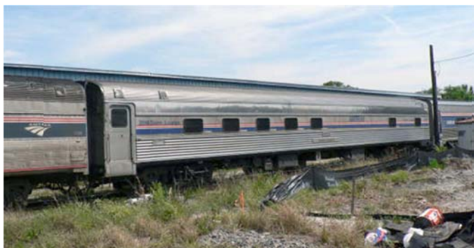
#2516 "Pacific Gardens" Tampa FL April 7, 2006 Amin Ricker

“The yielding of revenue space for employee use it's not very economical nor should passengers like it.”