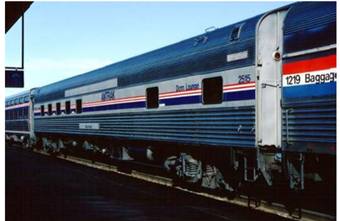
#2515 Pine Arroyo Rochester NY built by Budd 1949 ex ATSF 1617 ex Amtrak 2711 ex Amtrak 2983 July 10, 2000 Jim Hebner