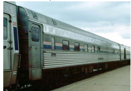
#2502 Pacific View South Bend IN Oct 5, 2000 Dick Leonhardt