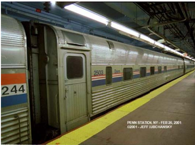
#2503 Pine Hill Penn Station New York NY Feb 26, 2001