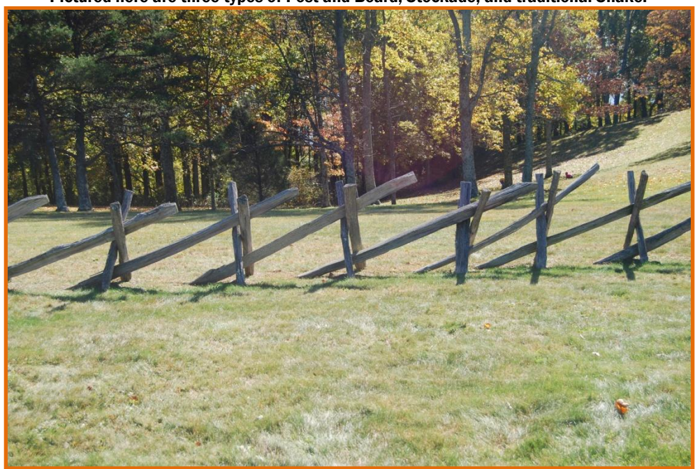
Here is a second style of snake fencing

Next month we will take a look at some modeling tips for building pioneer fences.