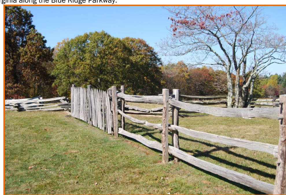
Pictured here are three types of Post and Board, Stockade, and traditional Snake.

The following photos are of pioneer fences. The rustic look and feel recommend them for use around that back country farm scene back up one of those hollars. These were found in Virginia along the Blue Ridge Parkway.