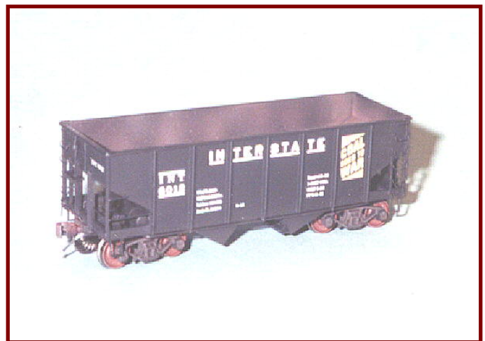
Interstate Hopper with "Coal Goes To War" Slogan

200 pcs. @ $9.98/each without the yellow printing hit (3 road numbers).