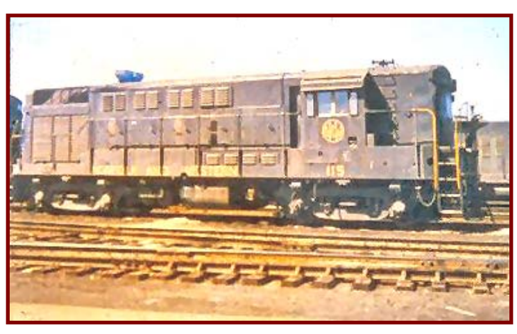
FM H16-44 No 115 Ex-VGN No. 15