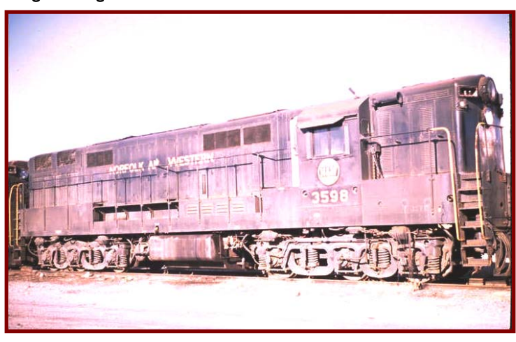
FM H24-66 No. 3598 (ex WAB598) at Bellevue, OH. This unit was repowered by Alco.