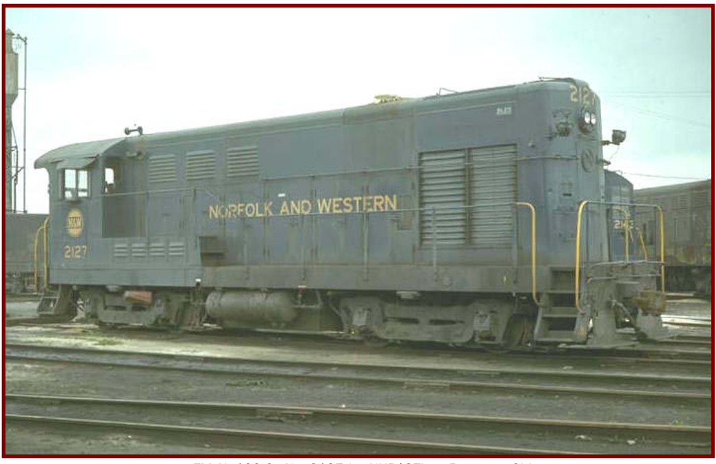
FM Alt 100.6a No. 2127 (ex NKP127), at Brewster, Ohio.