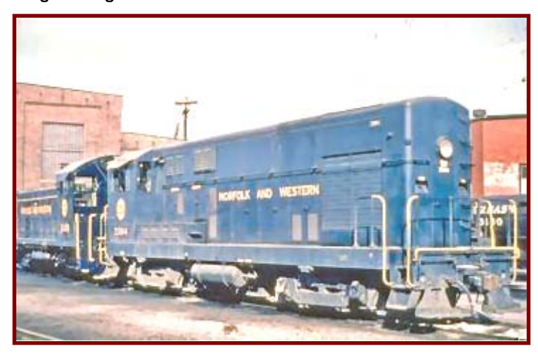
NOT FOLK AND WESTERN