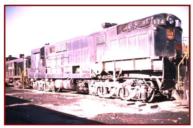
FM H24-66 No. 174 (ex VGN 74) at Roanoke, VA., in a wrecked condition.