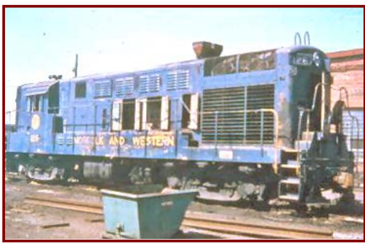
FM ALT 100.6A Ex-NKP No. 125 renumbered N&W No 2125