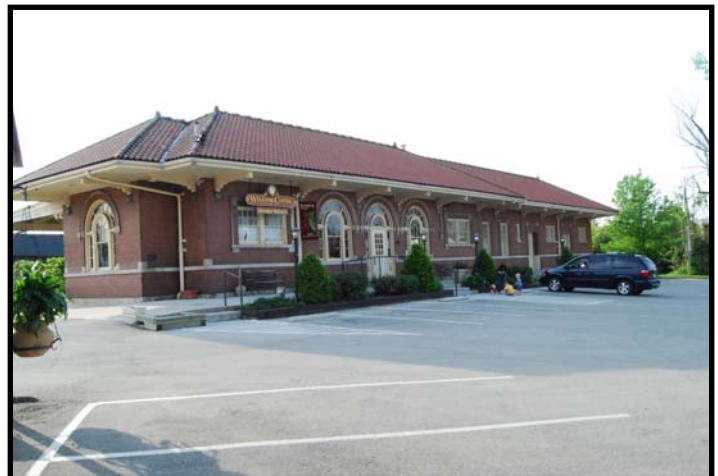
CSX Depot – Berea KY