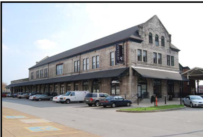
L&N Depot – Nashville TN