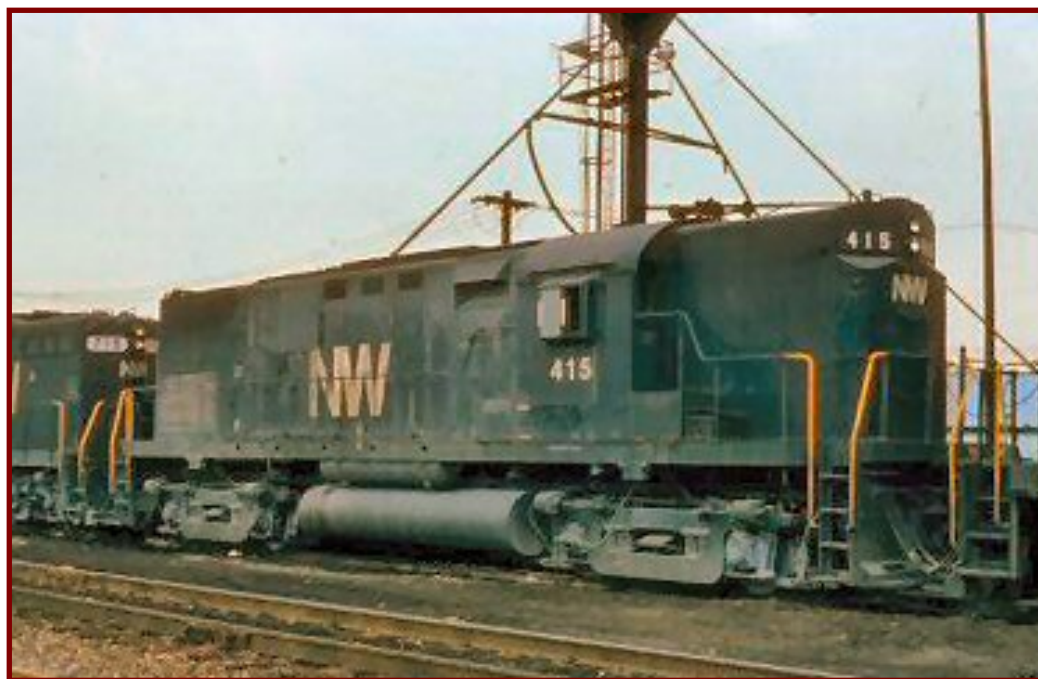
N&W ALCo C420 #415

The ALCO Century 420 was a four-axle, 2000 horsepower (1.5 MW) diesel locomotive of the road switcher type. 131 were built between June 1963 and August 1968. Cataloged as a part of ALCO's "Century" line of locomotives, the C420 was intended to replace the earlier RS-32 model. Since 2005, roughly 30% of C420 production exists. All units ordered by Mississippi State Export, New York, Chicago & St. Louis Railroad ("Nickel Plate"), and Piedmont & Northern Railway have been scrapped. The two units delivered to the Piedmont & Northern were the first of the Phase II units.