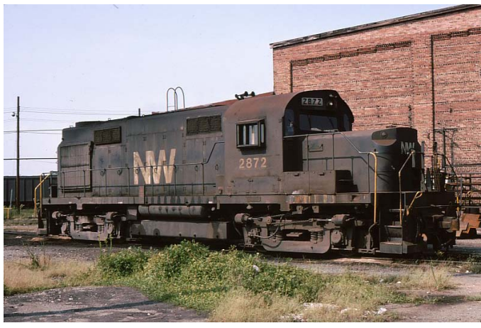
N&W 2872 (Ex-NKP)

N&W RS 36 2869 (Ex-NKP) Given their very low production numbers, it is interesting to note that a handful of RS32 and RS36 locomotives can still be found in service today on a few US shortlines and tourist railroads.