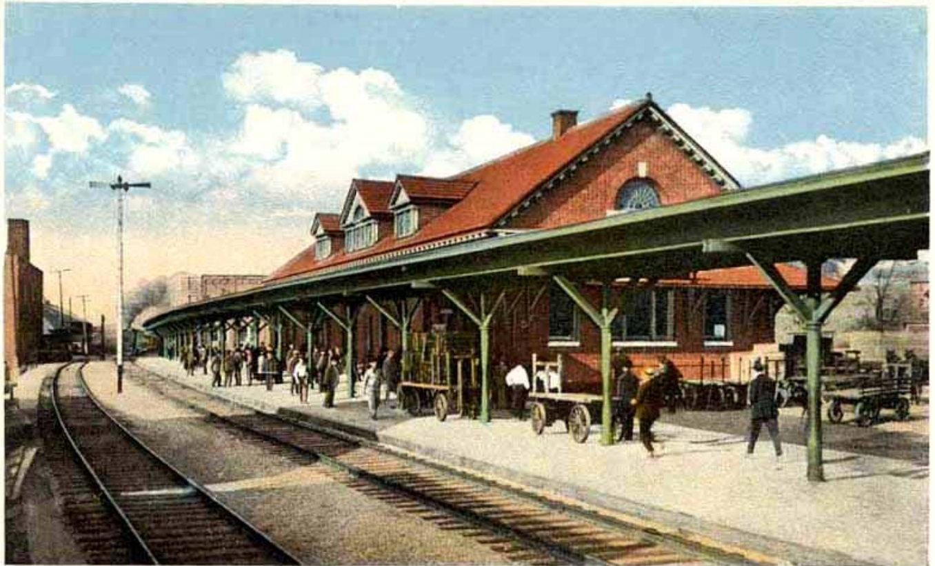
SOUTHERN R. R. STATION, JOHNSON CITY, TENN.