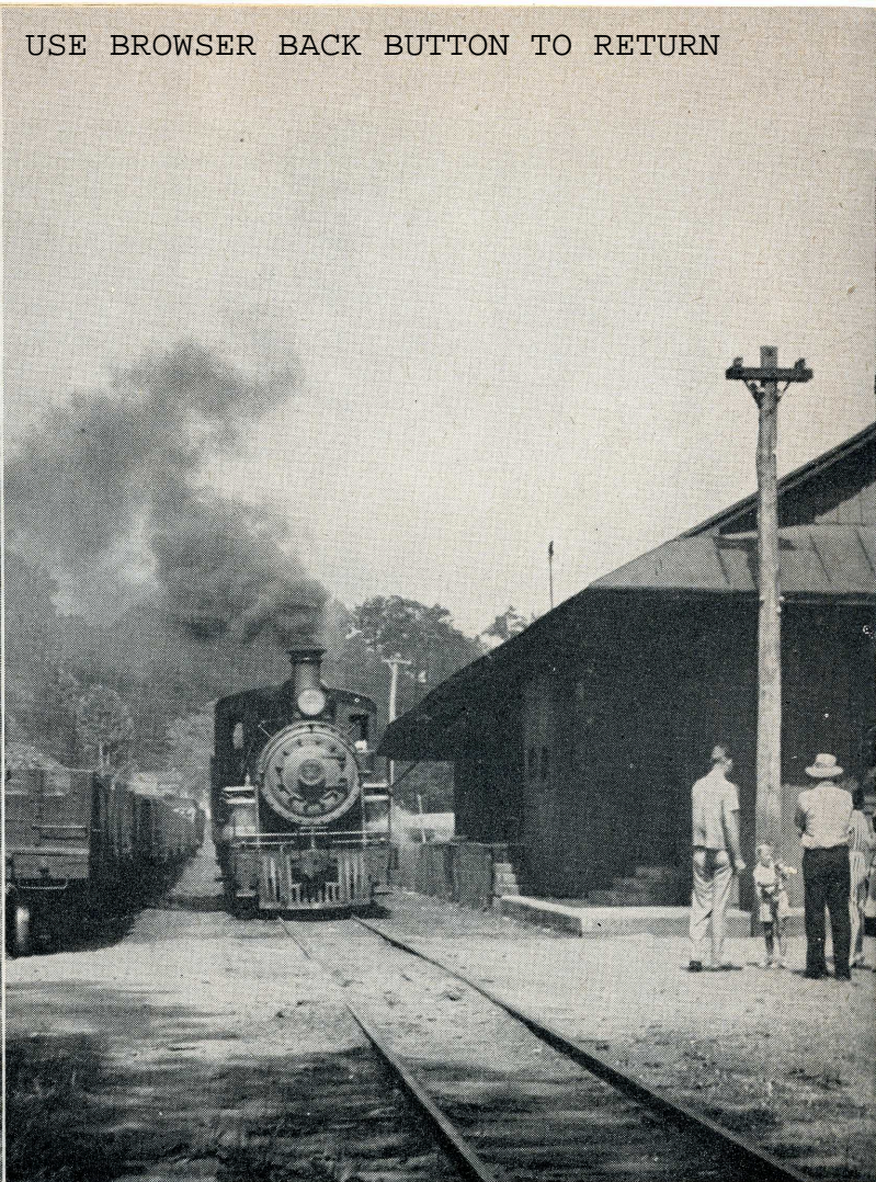
No. 11 rolls to a panting stop at Elk Park, N. C., after a hard climb up the 3 per cent grade from Elizabethton, Tenn. A few of the townsfolk have turned out to greet the train in true country tradition.