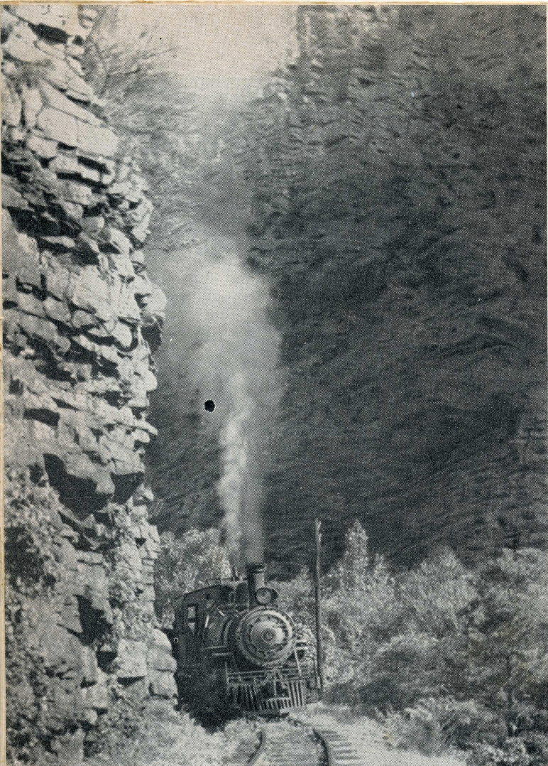
No. 11, Baldwin-built narrow-gauge Ten-Wheeler, cautiously pokes her nose around a shoulder of the mountain at Pardee Point in the Doe River Gorge. The magnificent scenery of the gorge attracted many tourists.